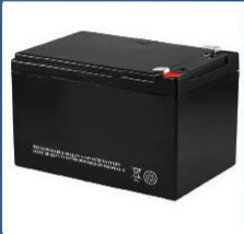
Charge Small Lead-Acid Batteries