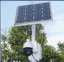
Charge Surveillance Systems