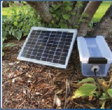
Charge Garden Lighting