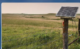
Charge Electric Fence Batteries