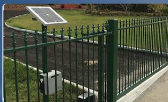
Charge Electric Gates