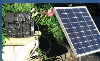
Charge Vehicle Batteries