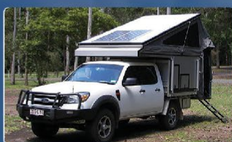
Ideal For Camping Applications