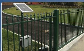
Charge Electric Gates