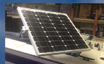
Ideal For 12V Marine Applications