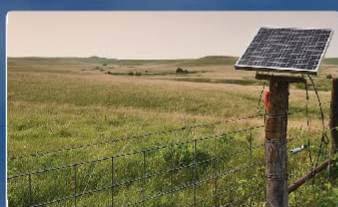
Charge Electric Fence Batteries