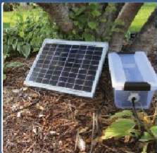
Charge Garden Lighting