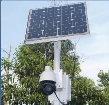
Charge Surveillance Systems