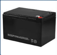
Charge Small Lead-Acid Batteries