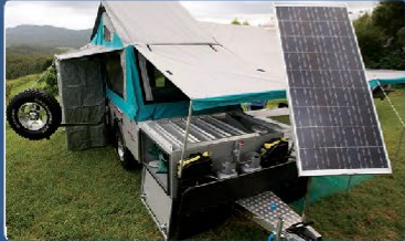
Ideal For 12V Camping Applications