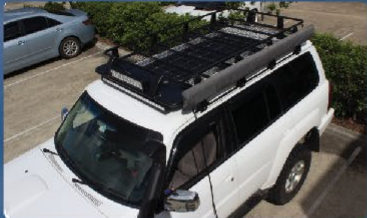
Secure To Vehicle Roofs