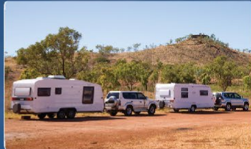
Ideal For Caravans, RV's & Motorhomes