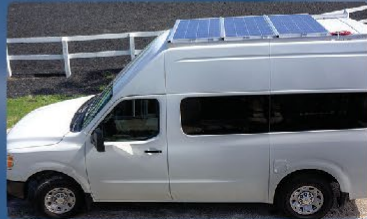
Ideal For Vans & Service