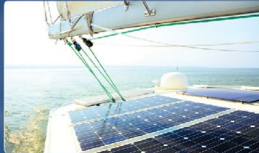
Ideal For Use With Boats & Yachts