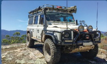
Ideal For 4x4 Applications