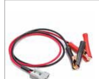
500mm length 4mm<sup>2</sup> twin core cable with 150 Amp heavy duty connector to a pair of positive & negative battery clamps.

Easily lift and transport your kit using the heavy duty carry handles which are mounted on 2 adjacent sides.