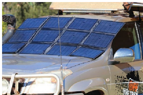
Can be placed across vehicle windscreens

The Solar Blanket unfolded is 1820mm x 920mm x 135mm and folds down to a convenient 400mm x 330mm x 135mm in size. Only 6.3Kg in weight, this kit is light and easy to transport.