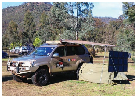
Hang up using loops attached to blanket