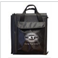
Easy transportation & storage