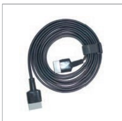
5M Power Lead