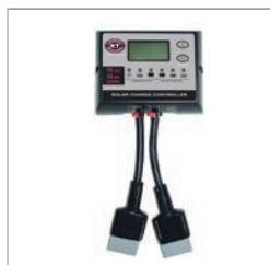
15A Solar Charge Controller

This one-piece, easy-fold design folds down to a compact bag with all accessories neatly tucked away inside. The panels feature a scratch-resistant mat coating for durability and folded tabs which allow you to secure the blanket to your vehicle and close the doors over the tab to reduce the chances of theft.