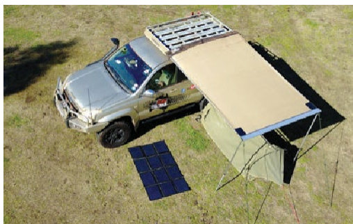
Can be layed flat across the ground