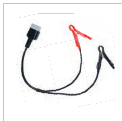
55cm Lead to Positive / Negative Battery Clamps