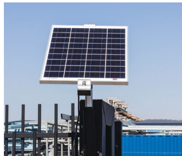
Ideal for rural properties with electric gates & security camera battery charging