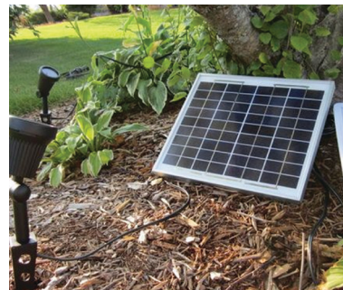
Ideal for garden lighting and outdoor applications