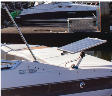
Charge your boat & jet ski batteries with ease. Also ideal for mounting & charging batteries on kayaks.

20 Watt Solar Panel Weight: 1.7Kg + 1.3Kg Mounting System = 3Kg