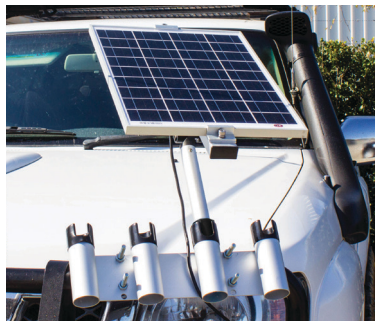
Fits easily into rod holders fitted to bull bars on 4WD's