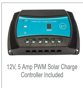
12V, 5 Amp PWM Solar Charge Controller Included