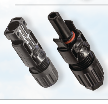
Model No. KT70774 Solar Panel MC4 Connector Twin Pack (Female & Male)